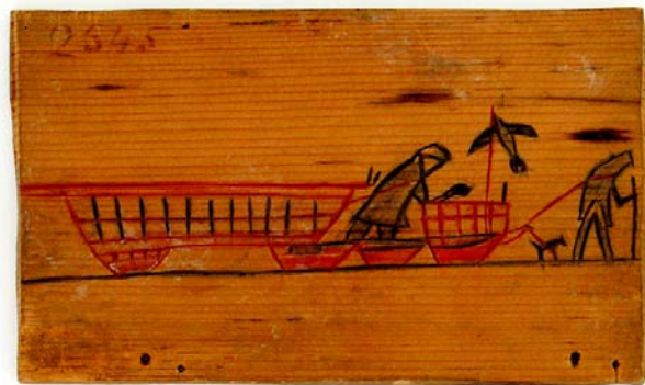
E-2545-6B Drawing on a Wood Plaque