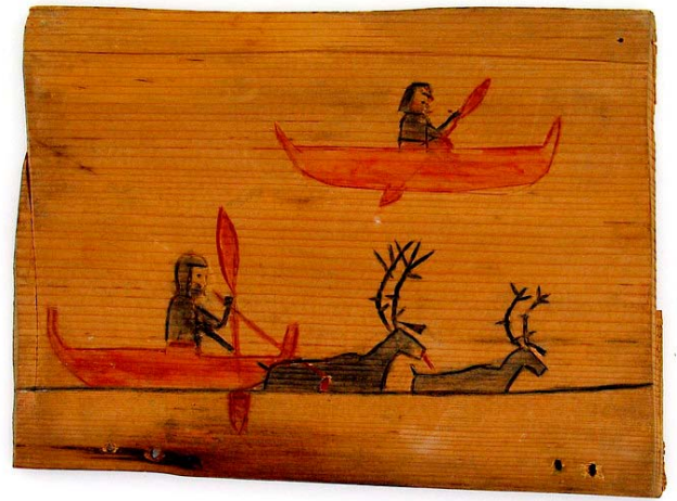
E-2545-4A Drawing on a Wood Plaque