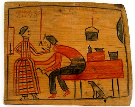
E-2545-7A Drawing on a Wood Plaque