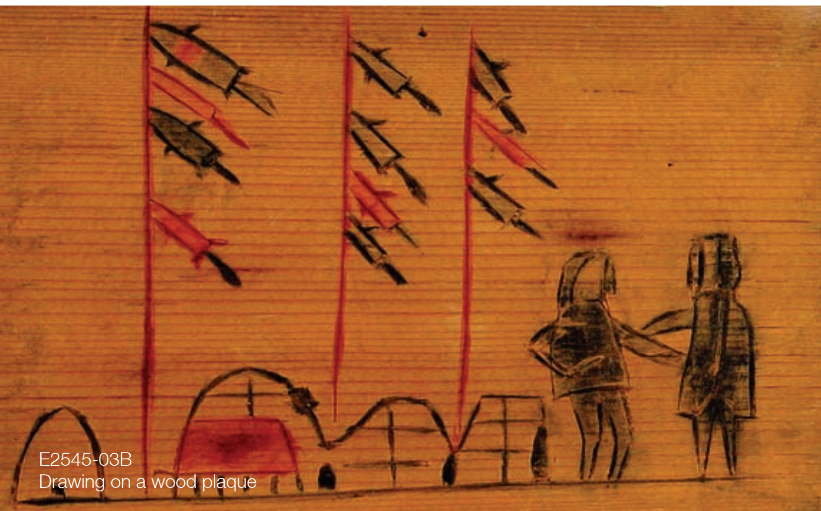
E2545-03B Drawing on a wood plaque