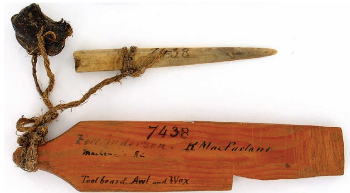
E-7438 Arrow Tool Kit