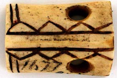
E-1677 Belt Buckle