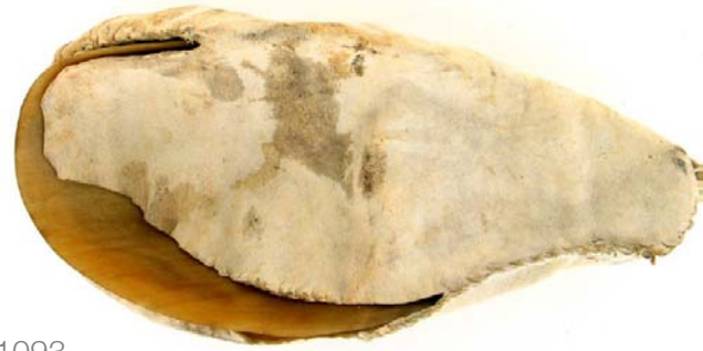
E-1093 Ice Scoop

1. What is the origin of Inuvialuit culture?